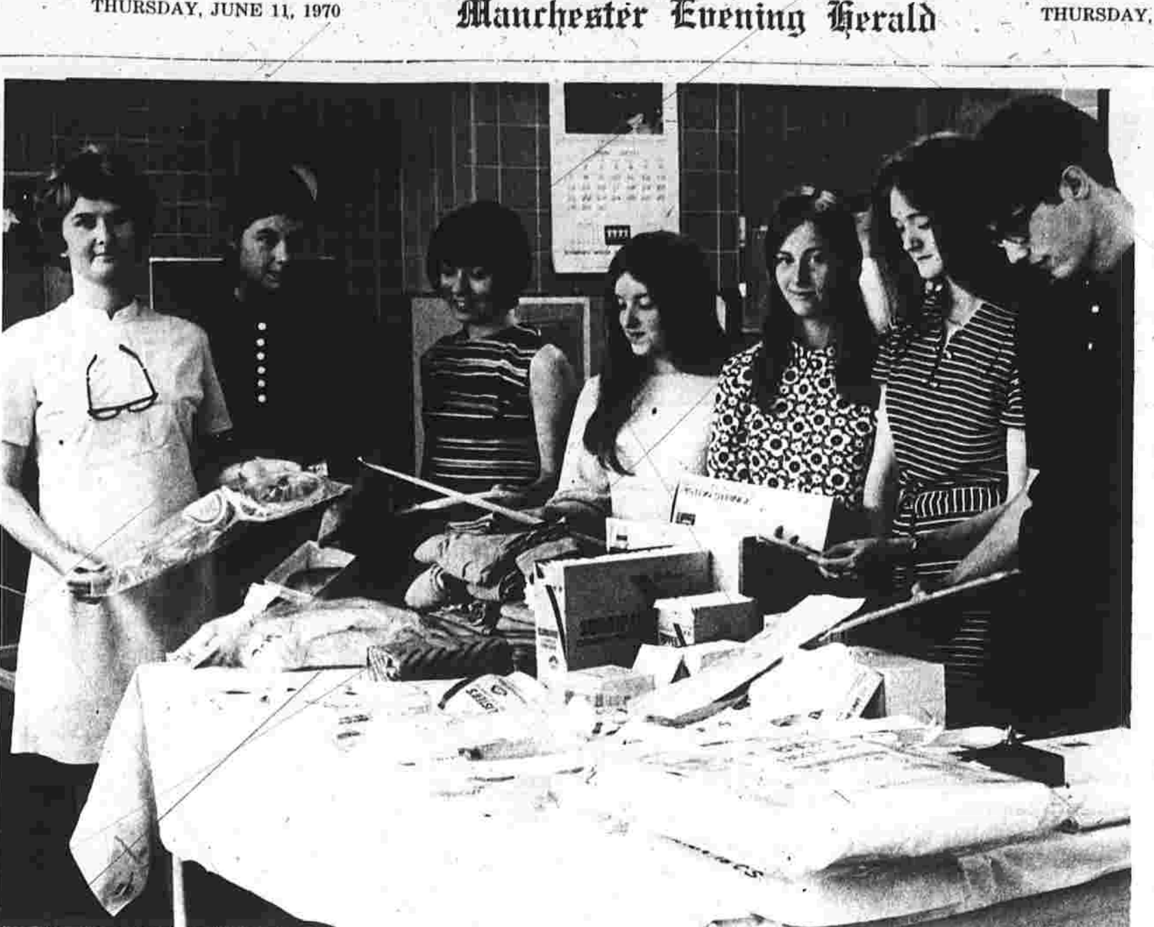
Recipients of the 1970 nursing scholarships look at some of the items kept in the Central Sterile Supply inventory on a third floor wing of the Manchester Hospital.

Section Two... Concert Best In History Of Orchestra... It was a most impressive concert at Bally's Auditorium last evening as the Manchester Civic Orchestra gave its final program of the season before an audience of moderate size.