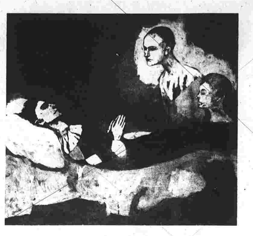
THE DEATH OF HARLEQUIN, PABLO PICASSO, 1905

conspiring with Germany. The generals were shot the next day. In 1949, Princeps Julius of the Netherlands arrived in Canada during World War II.